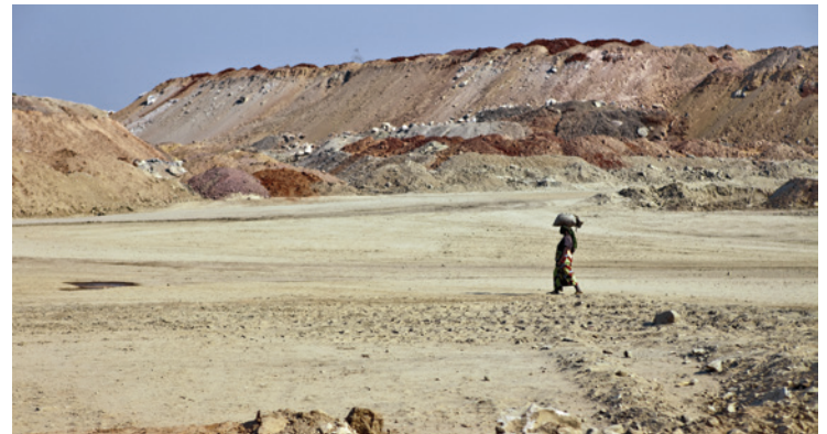
A woman crosses a mining area in Katanga province, Democratic Republic of the Congo. The Carter Center released a report last fall critical of the state-owned mining company's finances.

For example, Nigeria is beset with a full menu of neglected tropical diseases, but we have managed to help eliminate or stop transmission of trachoma, river blindness, and lymphatic filariasis in two states. Corruption is rife in the Democratic Republic of