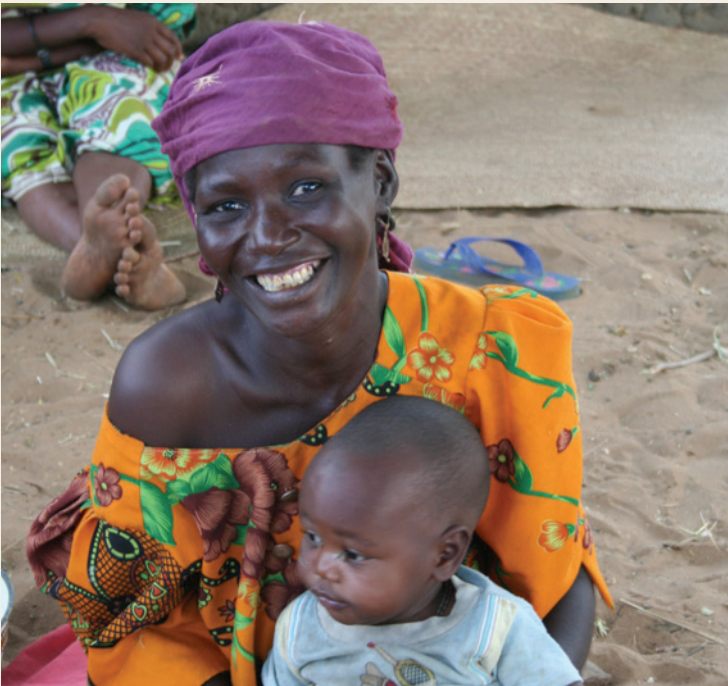
A Nigerian woman holds her baby. The Carter Center participated in a recent study in Niger and two other African countries that showed that the antibiotic used to treat trachoma also reduces mortality in young children.