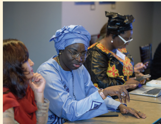
Aminata Touré, former prime minister of Senegal, leads a discussion during the two-day International Conference on Women and Access to Information in February at The Carter Center. Some 100 experts on gender or information participated.

In Bangladesh, women who attended courtyard meetings conducted by local partners later exercised their right to information to find out how to enroll in vocational training programs.