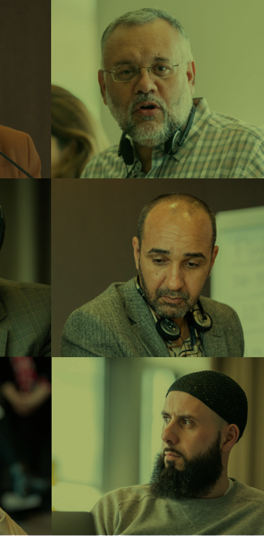
Pictured are some of the participants in a recent Carter Center workshop on preventing violent extremism.

cities about how to collaborate with civil society organizations, politicians, and others in their communities. They will give them media training and teach them how to more accurately interpret the Quran.