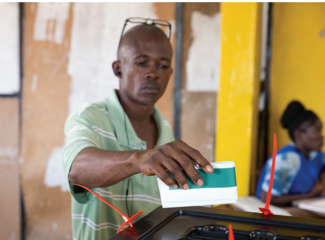
A Liberian man casts his vote for president last fall. The Carter Center sent 50 observers to monitor the election.

The experts offered about a dozen recommendations to improve Sierra Leone’s election process and citizens’ participation in it, including changes to the constitution.