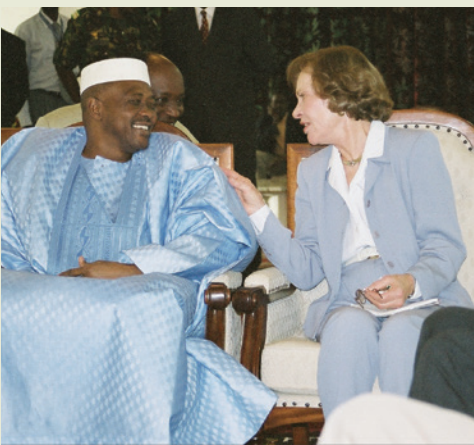
In this photo from February 2004, former U.S. First Lady Rosalynn Carter talks with Mali President Amadou Toumani Touré in Bamako. The Carter Center, which has a long history in Mali, is serving as Independent Observer to the country's 2015 peace agreement.

For nearly 30 years, the Center has worked with Mali's government to improve health all over the country. The Carter Center also assisted in election monitoring, promoted food security, and helped improve access to information.