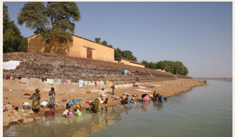
Malian women wash clothes in a river. The Carter Center is overseeing the implementation of a peace agreement in the large country.

The grant is part of the United Nations' Multidimensional Integrated Stabilization Mission in Mali, known as MINUSMA, supporting stabilization efforts in the West African nation, following a rebellion in 2011 and a coup d'état in 2012. A peace agreement between the government and two coalitions of armed groups was signed in 2015. See the News Brief on page 3 to learn more about the project.