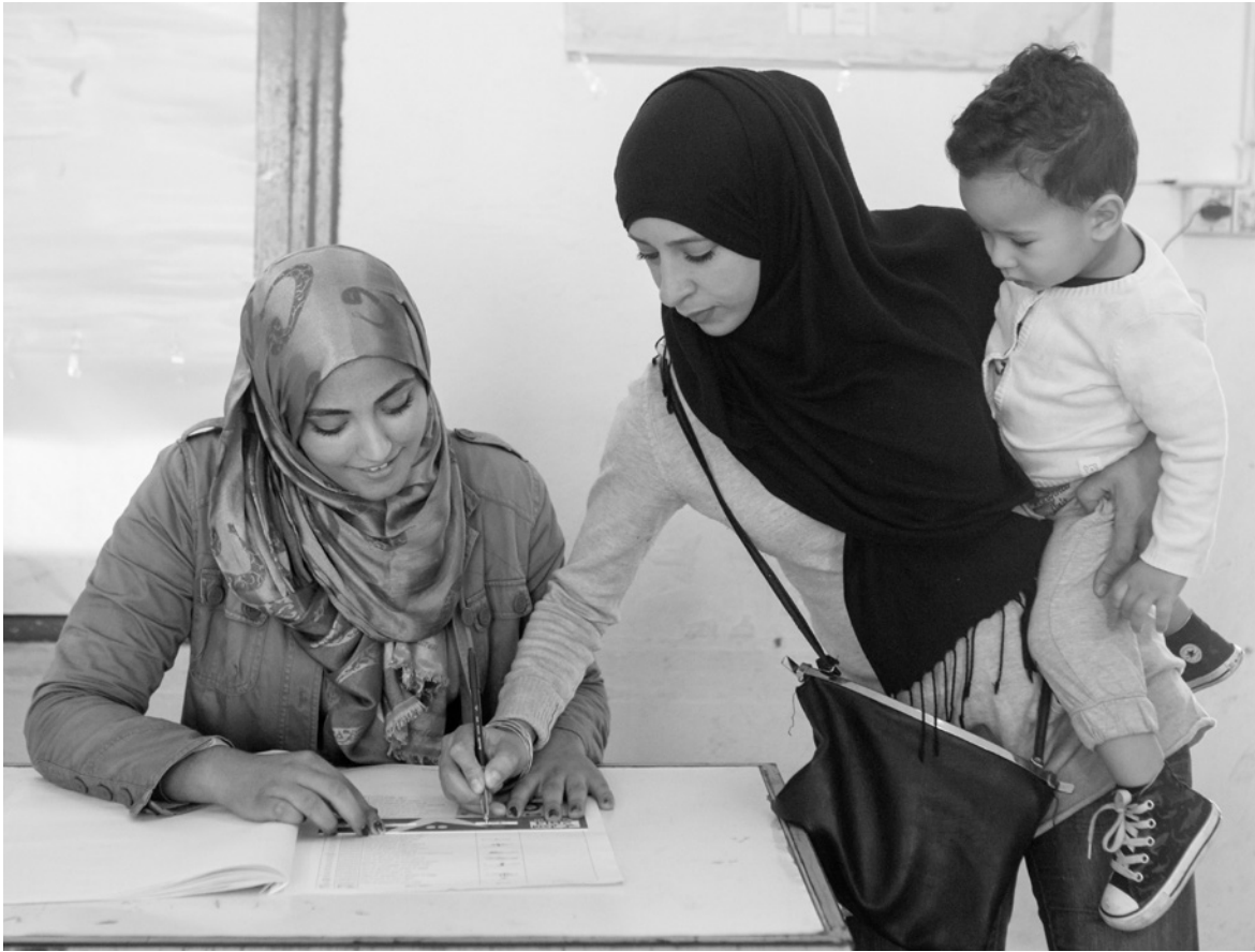
A Tunisian woman signs the register before voting. Individual polling stations were assigned up to 600 voters, who verified their registration at the stations by showing identification and signing the voter list.

removing deceased registrants and those registrants prohibited from voting by law.