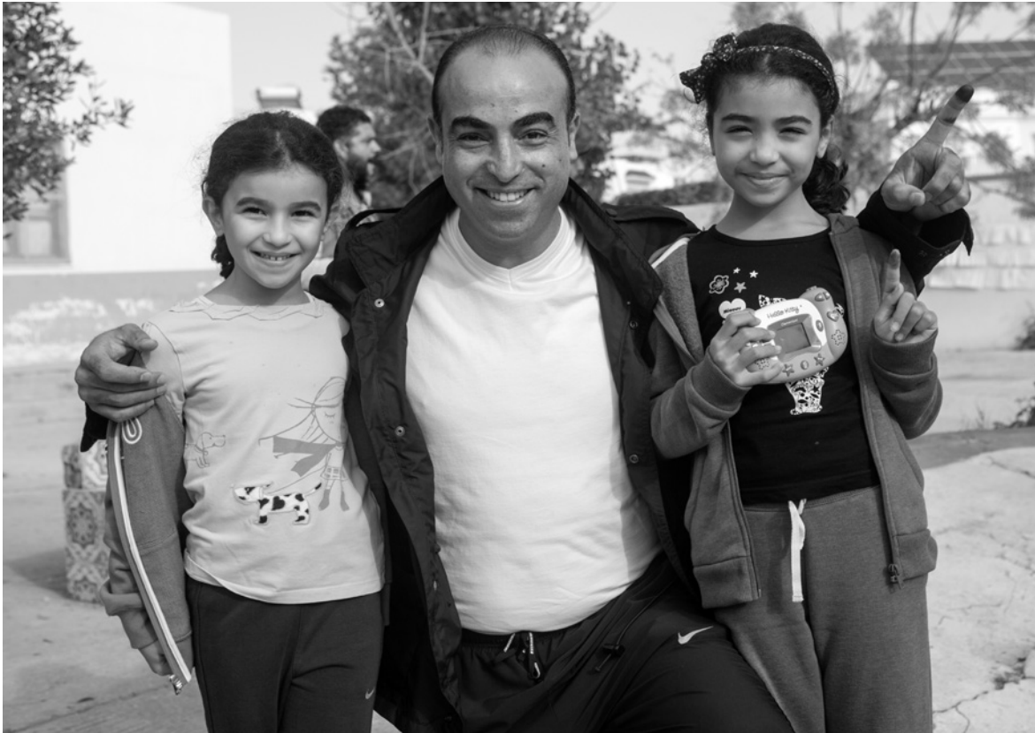
This Tunisian father took his daughters to the polls, proudly passing on the importance of voting.

at the cassation court as required by the law (eight cases), while in three of these cases there was also absence of notification of the ISIE.