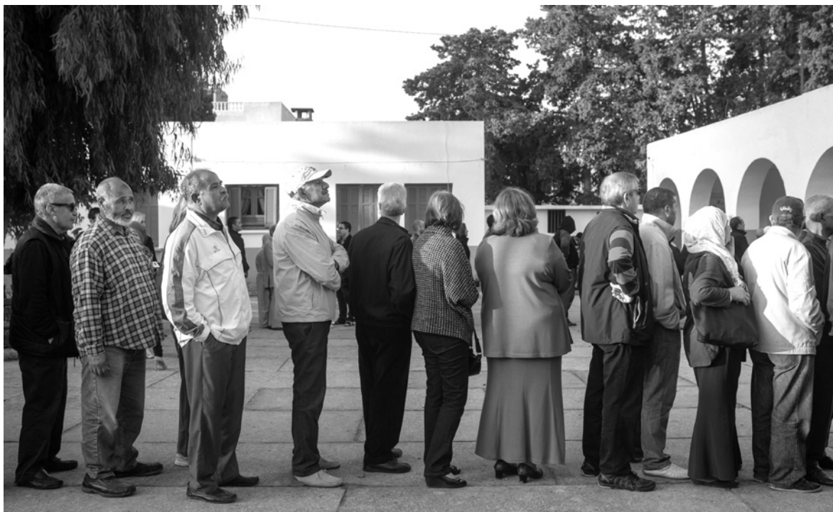
Voters form a queue outside a primary school that served as a polling station in Tunis.