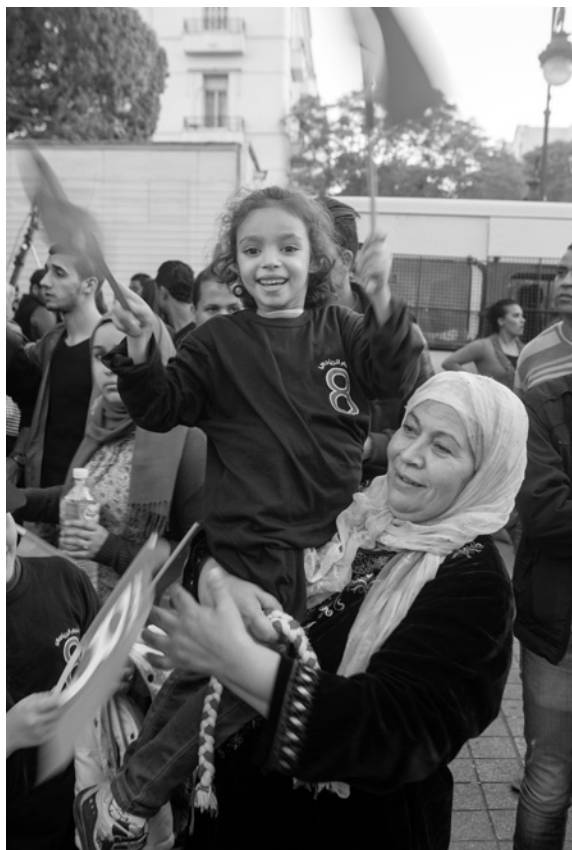
Citizens gather for a rally in support of presidential candidate Slim Riahi of the Free Patriotic Union party during the last day of campaigning before the election.