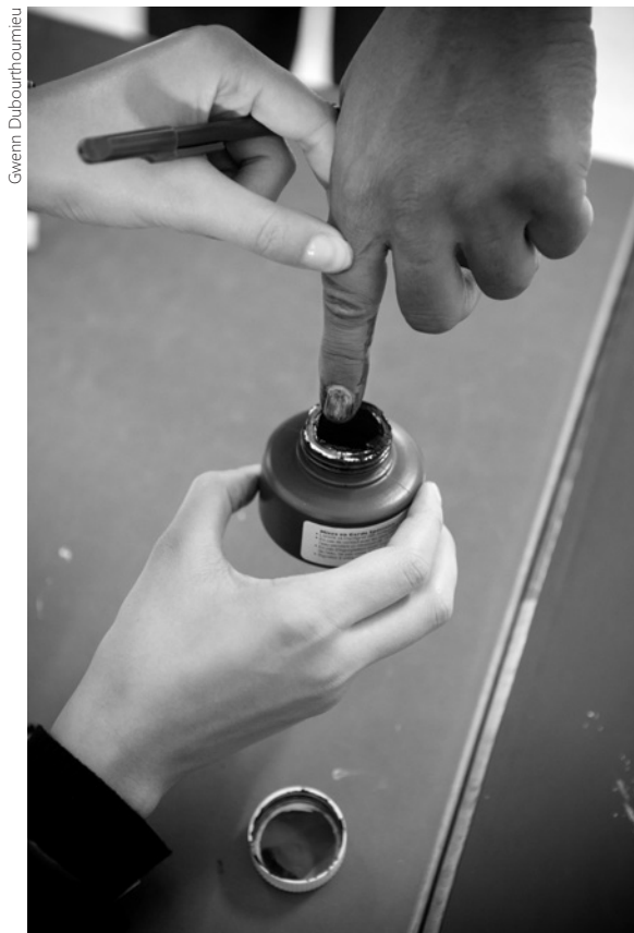
A man receives ink on his index finger before voting in the presidential election.

The tabulation process was delayed during the legislative elections and the first round of the