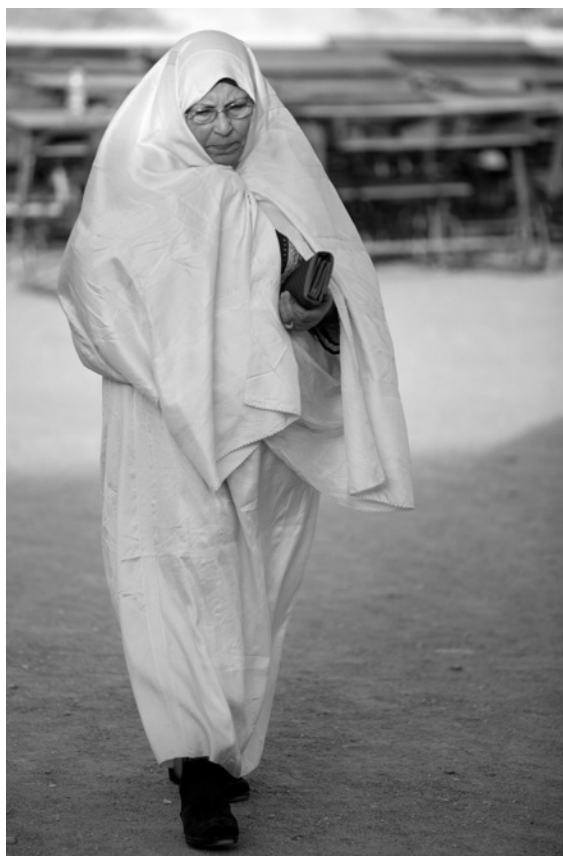
A woman leaves the Grombalia primary school polling station after voting in Slimane in the district of Nabeul in northeastern Tunisia.

distributed within 33 constituencies; 199 seats are allocated within 27 in-country constituencies, while 18 seats represent six overseas constituencies. This allocation resulted in significant