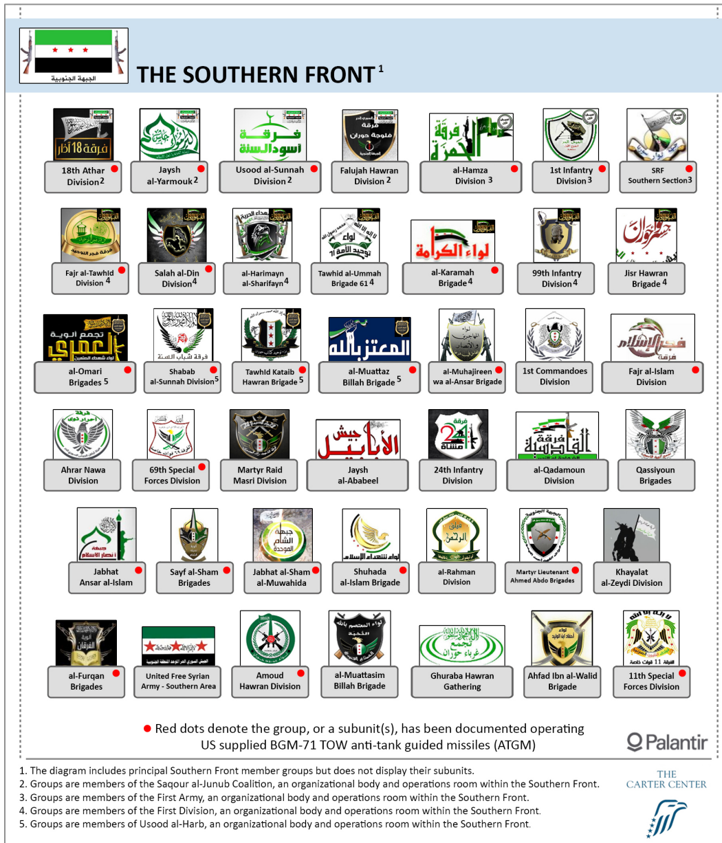
Figure 2: Principle members of the Southern Front as of early July 2015.

act collectively will likely be unsuccessful and counterproductive. Two recent developments exemplify these challenges.